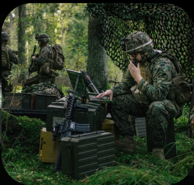
Military & security